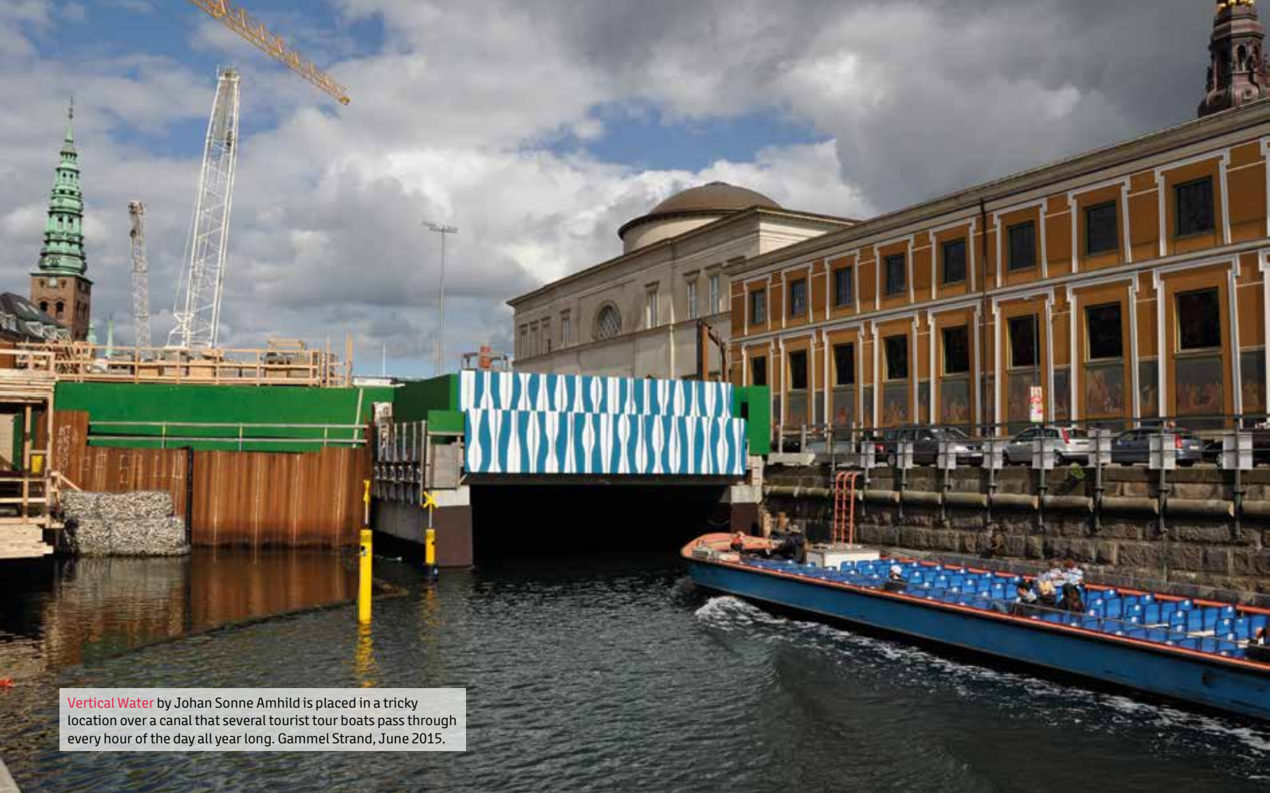
Vertical Water by Johan Sonne Amhild is placed in a tricky location over a canal that several tourist tour boats pass through every hour of the day all year long. Gammel Strand, June 2015.