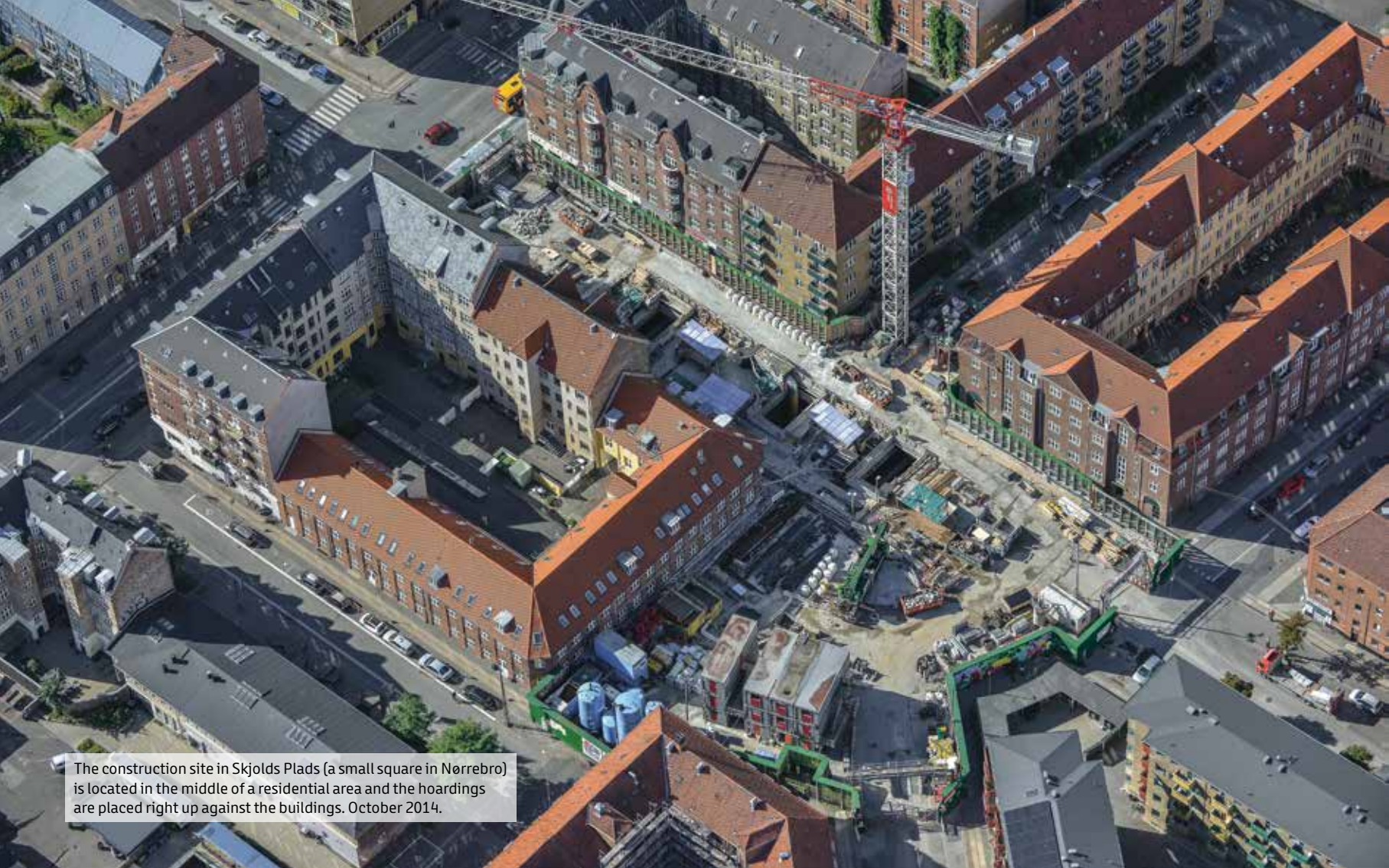
The construction site in Skjolds Plads (a small square in Nørrebro) is located in the middle of a residential area and the hoardings are placed right up against the buildings. October 2014.