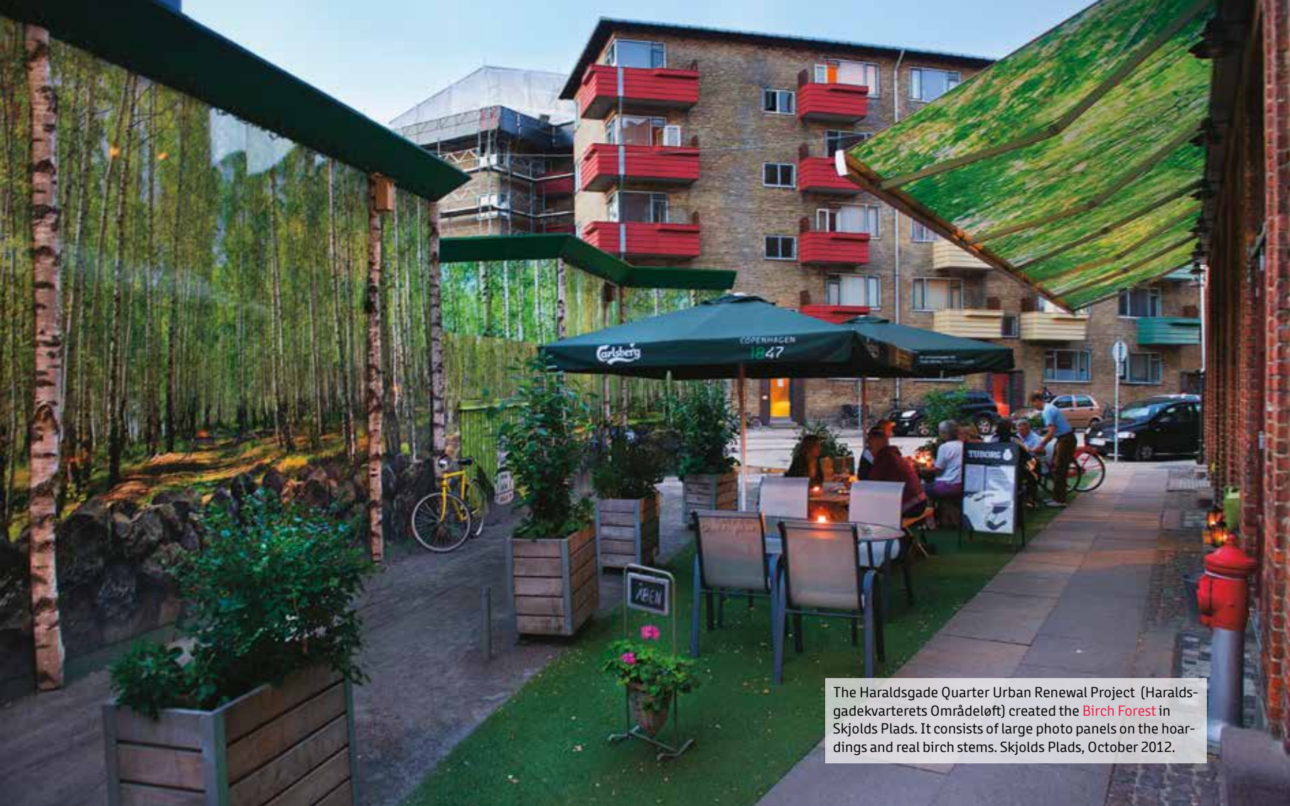
The Haraldsgade Quarter Urban Renewal Project (Haraldsgadekvarterets Områdeløft) created the Birch Forest in Skjolds Plads. It consists of large photo panels on the hoardings and real birch stems. Skjolds Plads, October 2012.