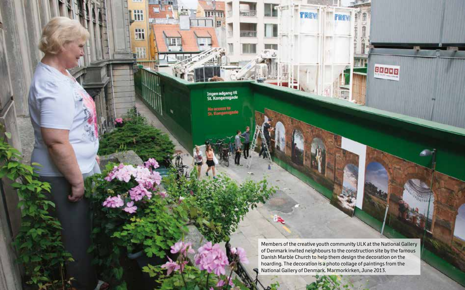
Members of the creative youth community ULK at the National Gallery of Denmark invited neighbours to the construction site by the famous Danish Marble Church to help them design the decoration on the hoarding. The decoration is a photo collage of paintings from the National Gallery of Denmark. Marmorkirken, June 2013.