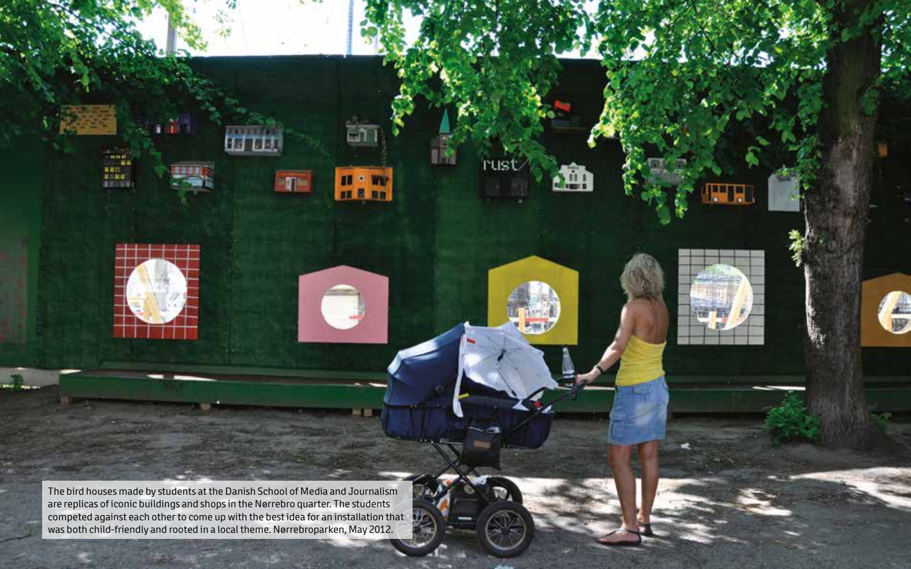
The bird houses made by students at the Danish School of Media and Journalism are replicas of iconic buildings and shops in the Nørrebro quarter. The students competed against each other to come up with the best idea for an installation that was both child-friendly and rooted in a local theme. Nørrebroparken, May 2012.