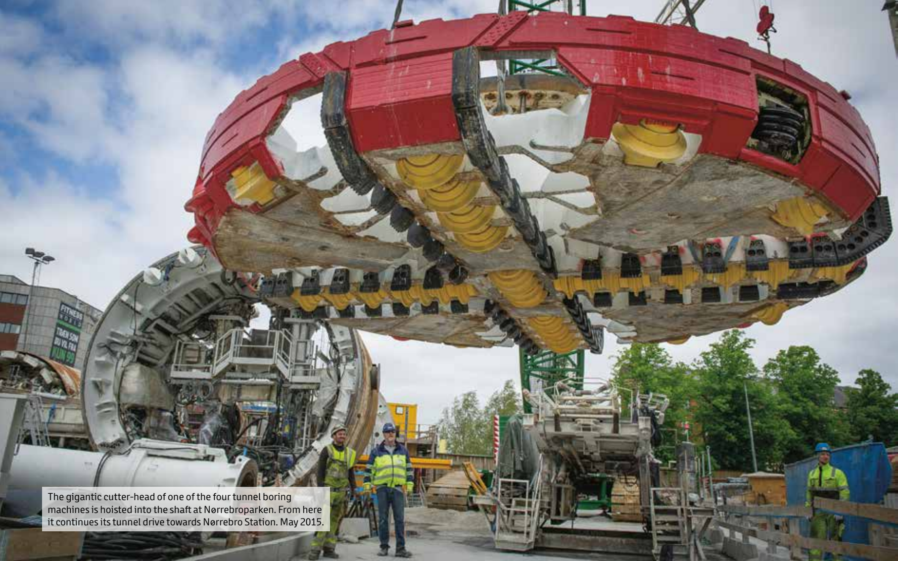
The gigantic cutter-head of one of the four tunnel boring machines is hoisted into the shaft at Nørrebroparken. From here it continues its tunnel drive towards Nørrebro Station. May 2015.