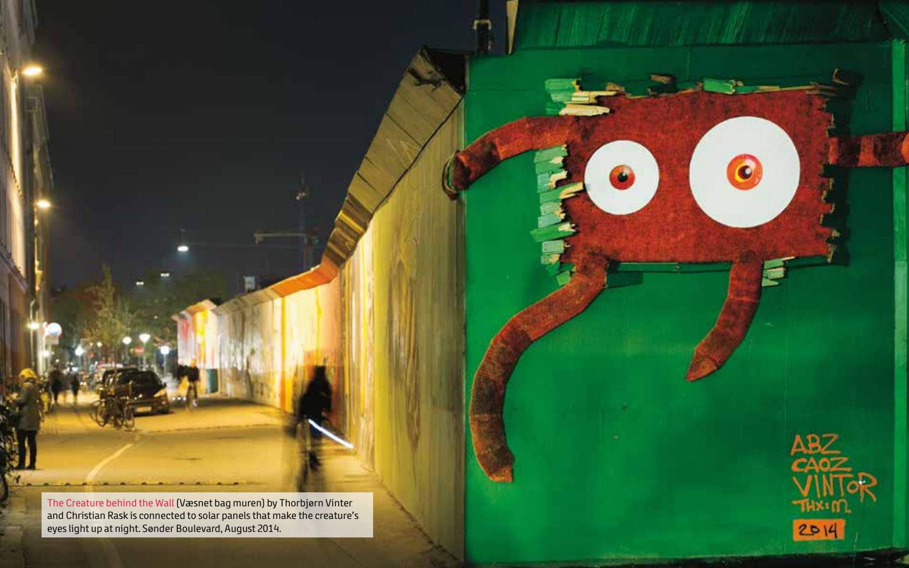
The Creature behind the Wall (Væsnet bag muren) by Thorbjørn Vinter and Christian Rask is connected to solar panels that make the creature's eyes light up at night. Sønder Boulevard, August 2014.