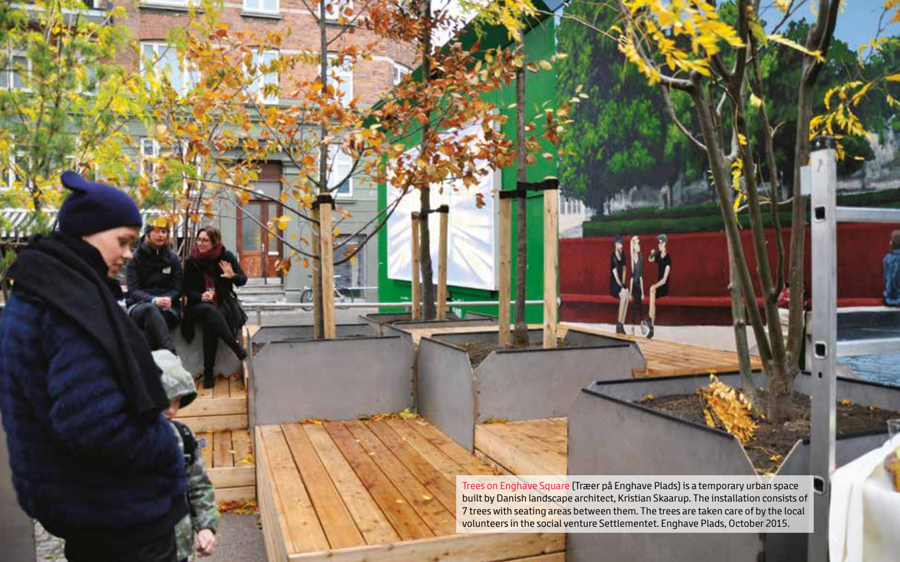
Trees on Enghave Square (Træer på Enghave Plads) is a temporary urban space built by Danish landscape architect, Kristian Skaarup. The installation consists of 7 trees with seating areas between them. The trees are taken care of by the local volunteers in the social venture Settlementet. Enghave Plads, October 2015.