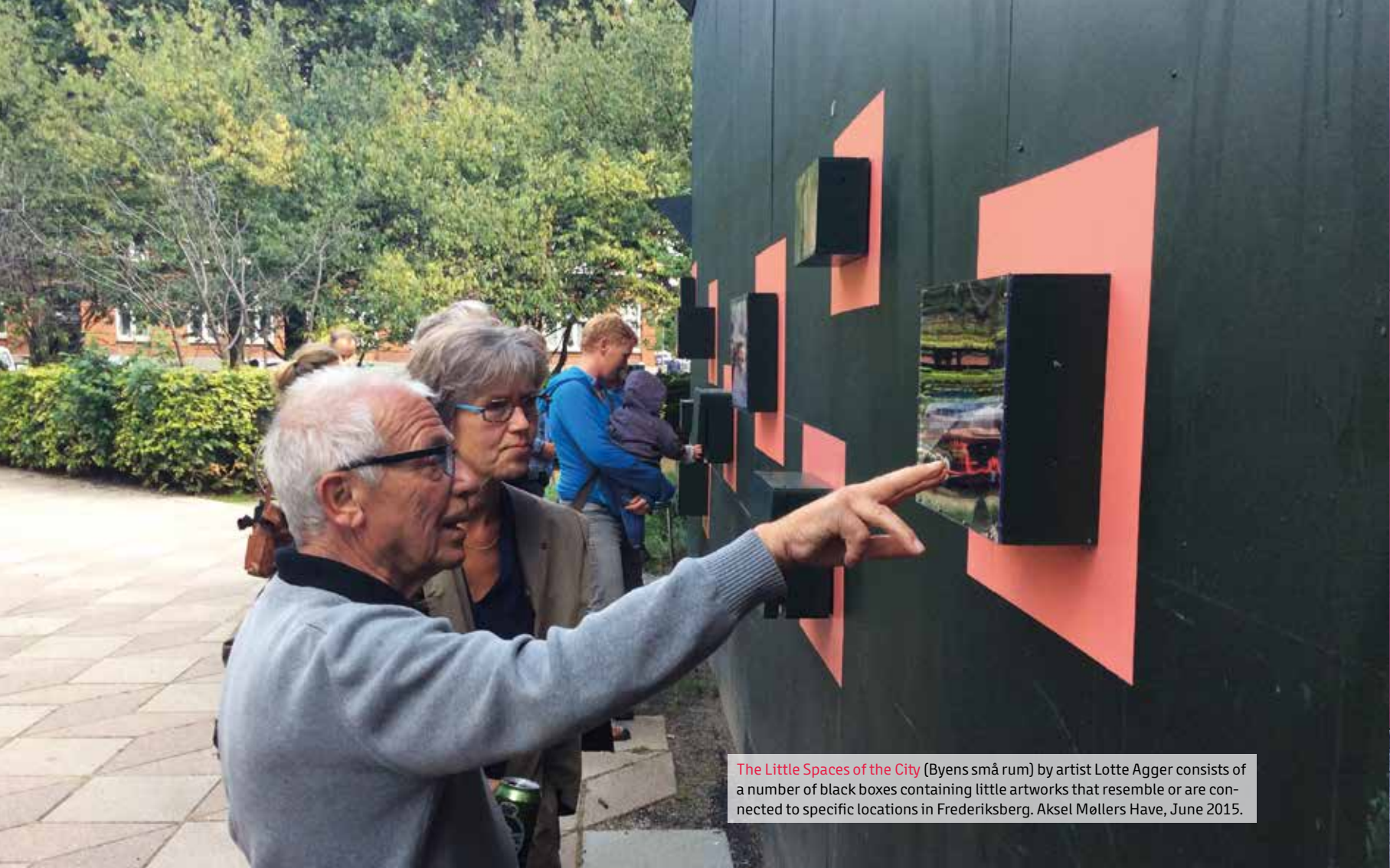
The Little Spaces of the City (Byens små rum) by artist Lotte Agger consists of a number of black boxes containing little artworks that resemble or are connected to specific locations in Frederiksberg. Aksel Møllers Have, June 2015.