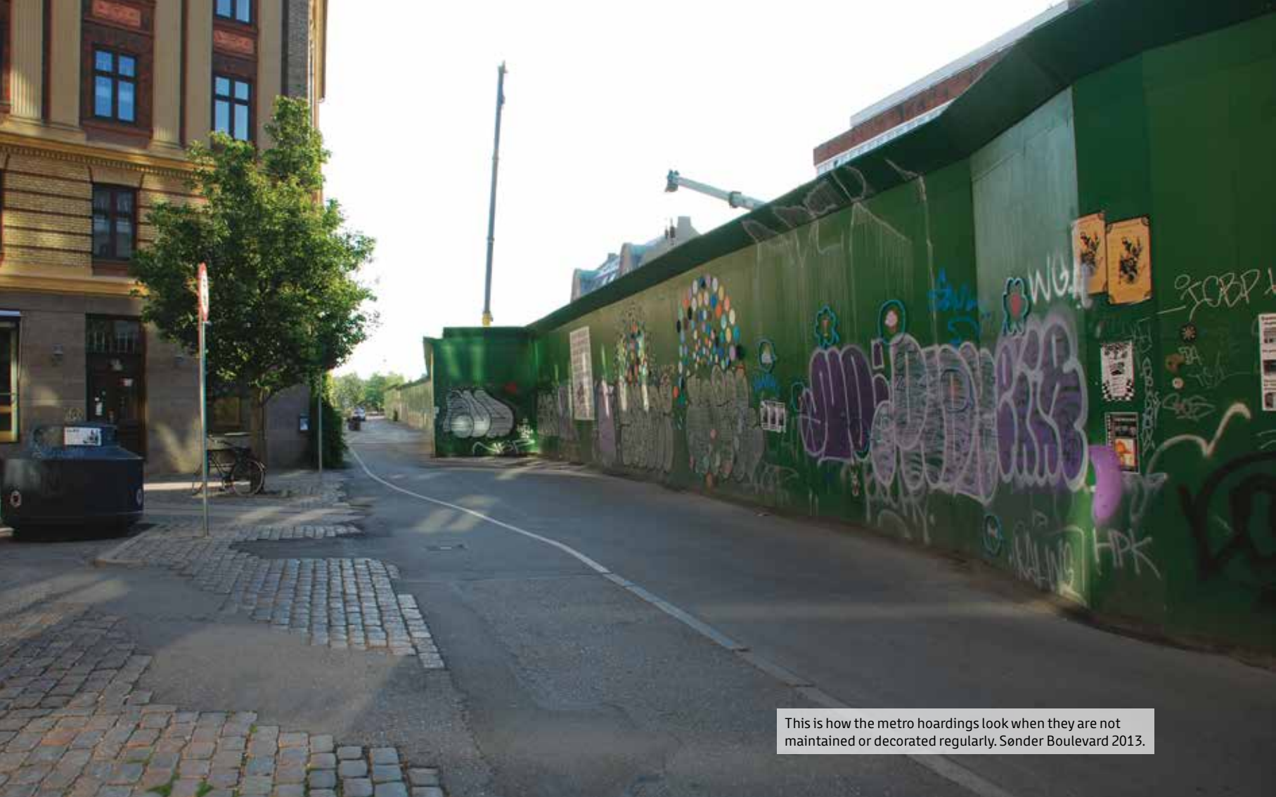
This is how the metro hoardings look when they are not maintained or decorated regularly. Sønder Boulevard 2013.