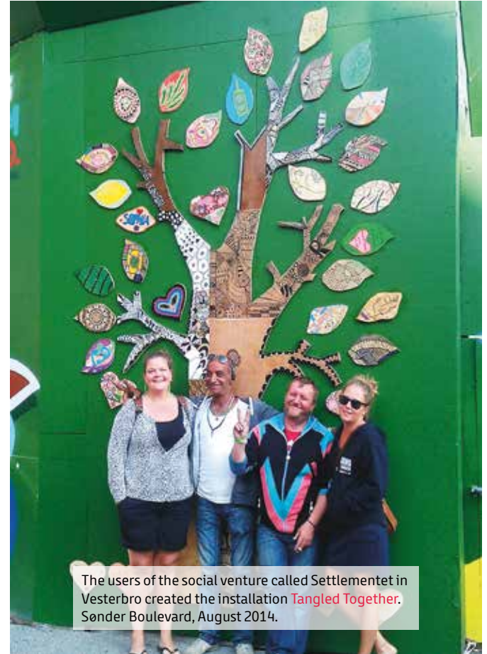
The users of the social venture called Settlementet in Vesterbro created the installation Tangled Together . Sønder Boulevard, August 2014.

On the giant canvas of the Metro hoardings you will therefore find a range of practitioners from self-taught graffiti artists to school children who are given the opportunity to display their artistic abilities and creative talent. More than 100 new projects are featured on the hoardings each year.