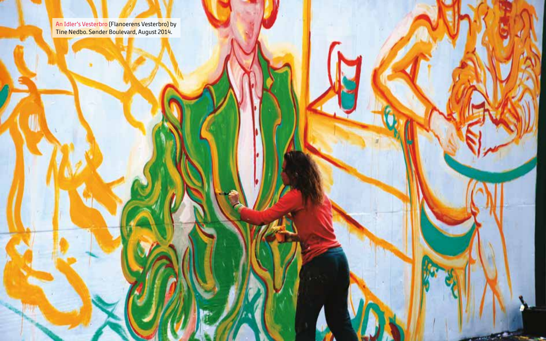
An Idler's Vesterbro (Flanoerens Vesterbro) by Tine Nedbo. Sønder Boulevard, August 2014.