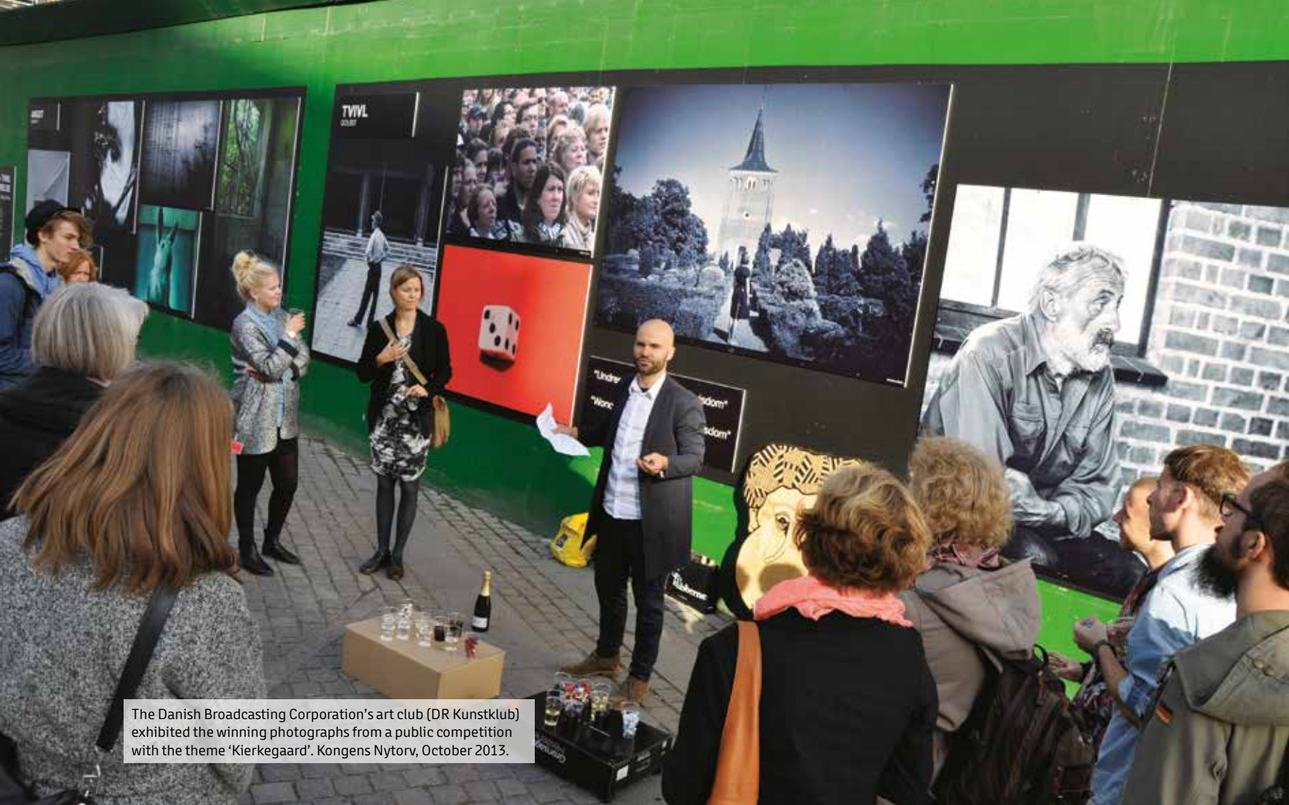
The Danish Broadcasting Corporation's art club (DR Kunstklub) exhibited the winning photographs from a public competition with the theme 'Kierkegaard'. Kongens Nytorv, October 2013.