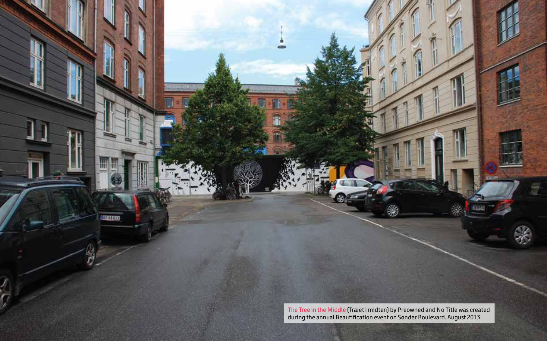
The Tree in the Middle (Træet i midten) by Preowned and No Title was created during the annual Beautification event on Sønder Boulevard, August 2013.