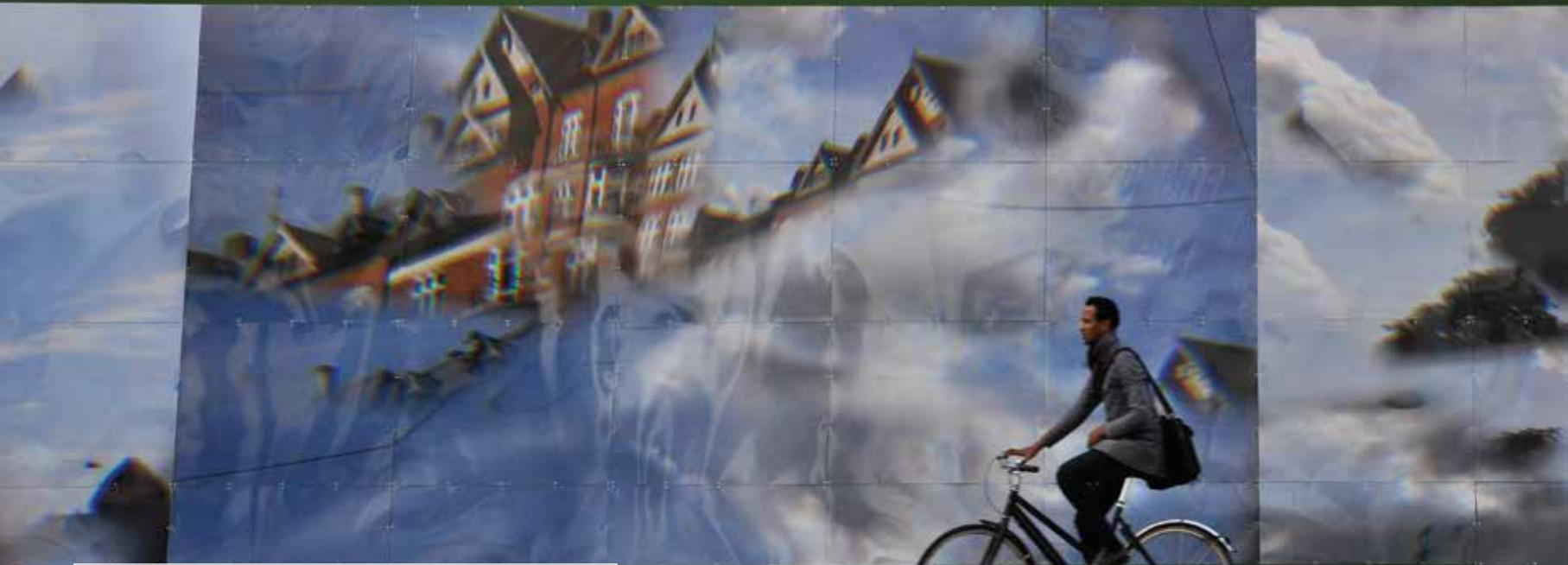
Photo artist Sonja Strange created the enormous artwork Fusion by photographing the surrounding buildings through a small glass prism that she usually wears around her neck. Nuuks Plads, August 2014.