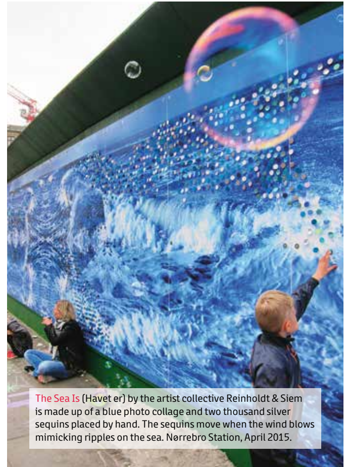
The Sea Is (Havet er) by the artist collective Reinholdt & Siem is made up of a blue photo collage and two thousand silver sequins placed by hand. The sequins move when the wind blows mimicking ripples on the sea. Nørrebro Station, April 2015.

During the time it takes to construct the new Metro line Cityringen, the city is host to some 6 kilometres of hoarding around 21 construction sites in the middle of Copenhagen and Frederiksberg. The green wooden hoarding has been given the title 'Cool Construction' – and it constitutes the biggest art exhibition in the country.