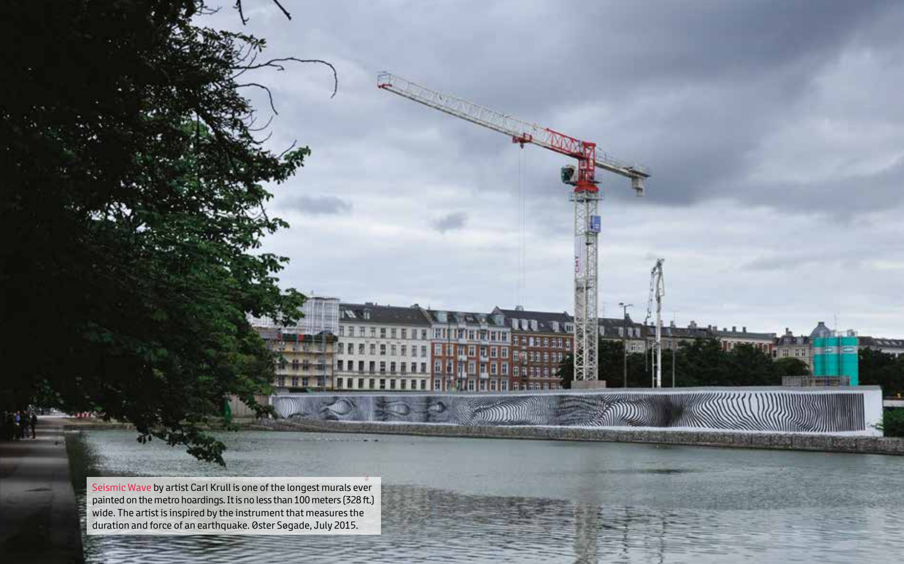
Seismic Wave by artist Carl Krull is one of the longest murals ever painted on the metro hoardings. It is no less than 100 meters (328 ft.) wide. The artist is inspired by the instrument that measures the duration and force of an earthquake. Øster Søgade, July 2015.