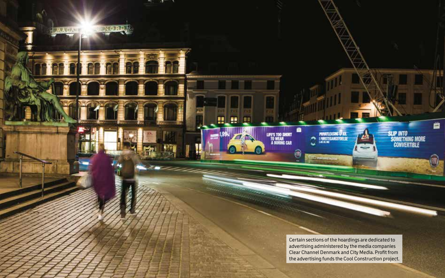
Certain sections of the hoardings are dedicated to advertising administered by the media companies Clear Channel Denmark and City Media. Profit from the advertising funds the Cool Construction project.