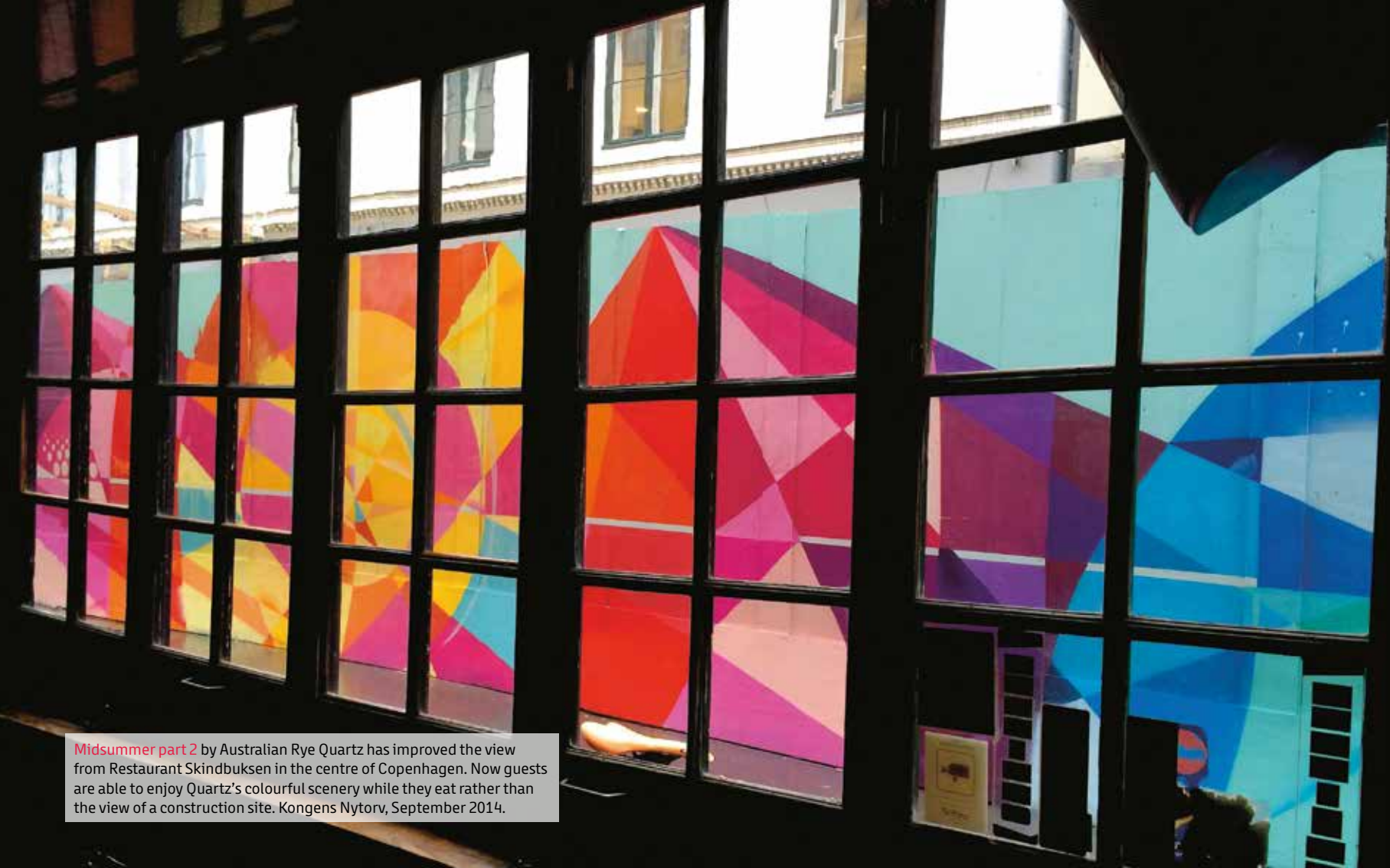
Midsummer part 2 by Australian Rye Quartz has improved the view from Restaurant Skindbuksen in the centre of Copenhagen. Now guests are able to enjoy Quartz's colourful scenery while they eat rather than the view of a construction site. Kongens Nytorv, September 2014.